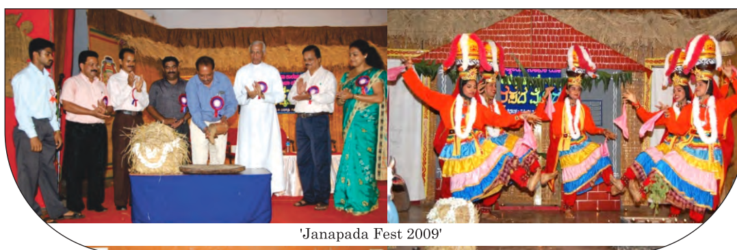
'Janapada Fest 2009'