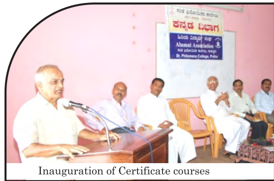
Inauguration of Certificate courses