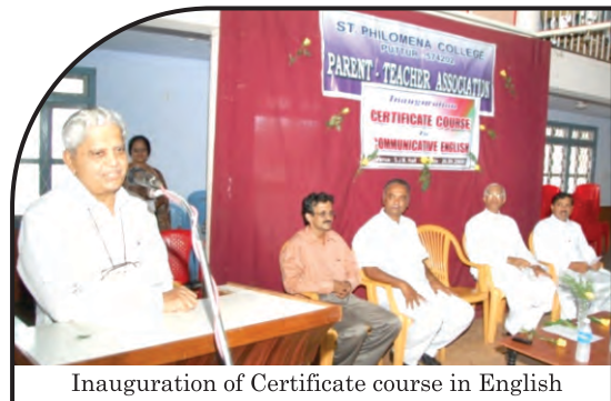
Inauguration of Certificate course in English