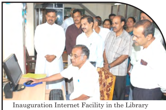
Inauguration Internet Facility in the Library