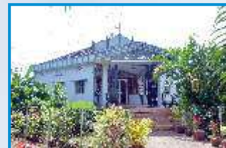
DIVYA CHETHANA HALL